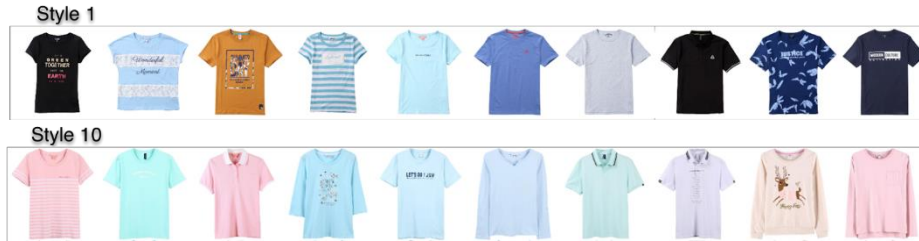
Fig. 2. The product images for the discovered styles with high popularity.