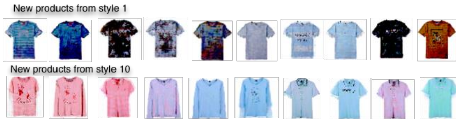
Fig. 4. Examples of new fashion products generated from style 1 and style 10.

both have very complicated prints compared to the styles with higher popularity in Fig.2. From this observation, we can say that customers in our data prefer simple and refreshing styles than complicated design with detailed prints.